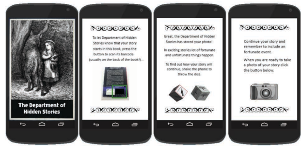
Figure 2. DoHS create mode main screens

Having started writing their story the children would then randomly choose a fortunate or unfortunate event card to continue their story and select another book. The game would continue like this with a succession of fortunate and unfortunate events encouraging the child to return to the library space and come into contact with more books. In order to support different learning styles and relax constraints as much as possible, we did not limit the number of cards children could take, or how much room they could use on the tables. However, the children were warned 10 minutes before the game ended to allow them time to complete their stories. After this the children reviewed all the stories together.